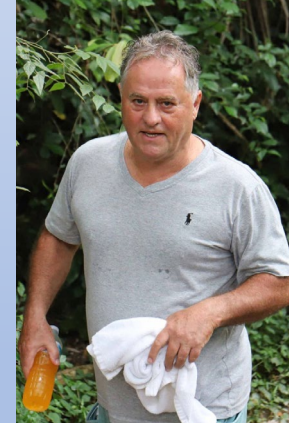
12th Feb 2022 Run 960 DFL