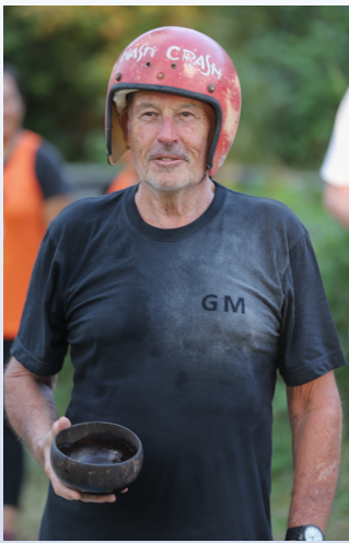
22nd Jan 2022 Run 957 Tangerine Man