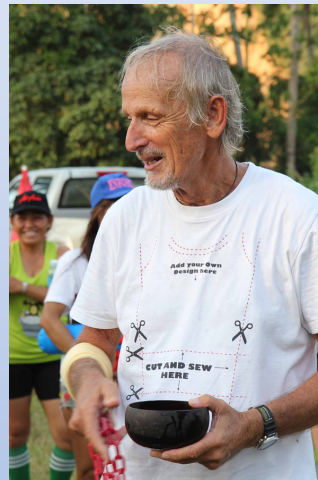
5th Feb 2022 Run 959 No Balls

No F'ing Clue lived up to his name as Hareline and there was some confusion over next weeks Hare with Urine Trouble and Tangerine Man both trying to don the official wig!